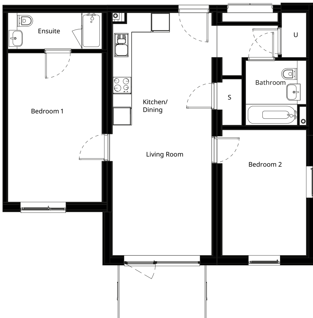
2 Bedroom Apartment - Type A

The open plan kitchen/living/dining area opens onto its own private balcony, allowing light to flood in and adding to the sense of space on offer here. Bedroom one enjoys the benefit of an en-suite, while the well-proportioned bedroom two, has access to the generous family bathroom, which includes a bath.